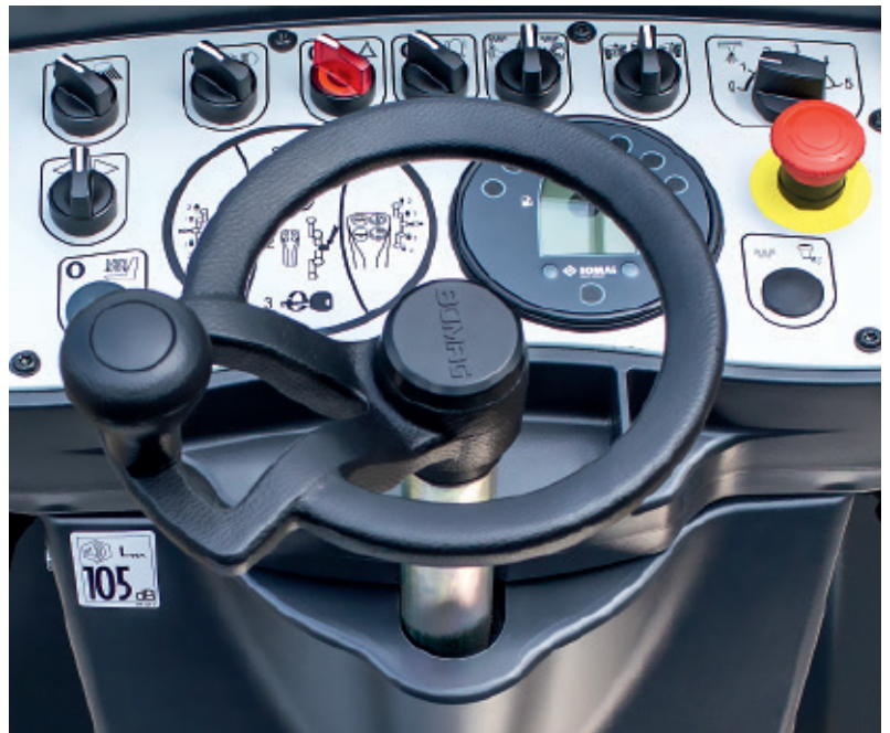
Large switches, a compact steering wheel and clearly arranged controls make it easy for any operator to work with a light BOMAG tandem roller.

Every function is self-explanatory and intuitive to operate after a very short time. As with every BOMAG tandem roller, the main functions can be selected precisely and error-free by the ergonomic control lever.