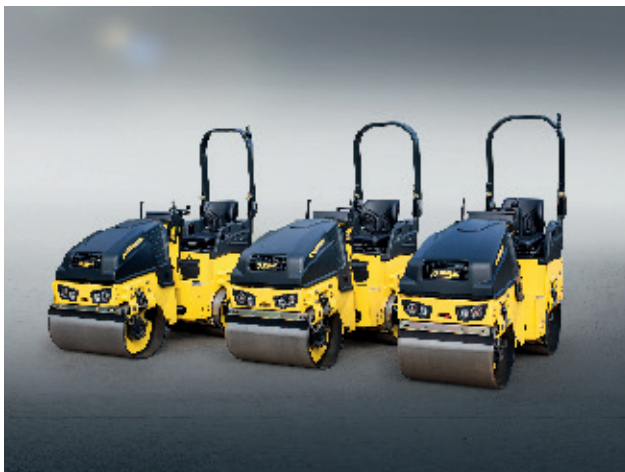
BW 80/90/100: The light line up to 1.8 t.