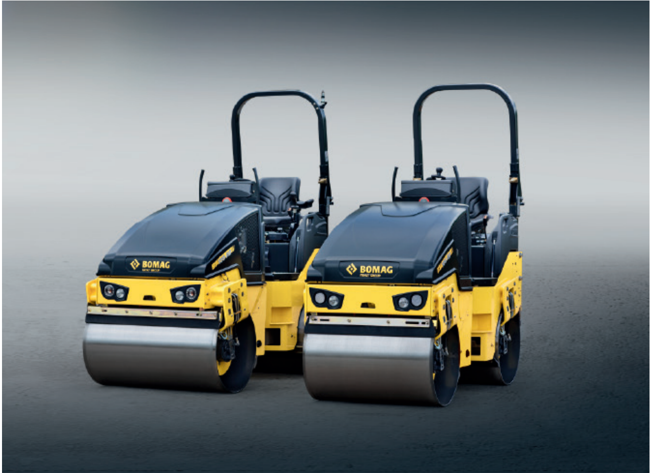
BW100/120: The multi-talents from 2.3 to 3.7 t.

BOMAG offers the right machine for every application. Select the roller and equipment that is perfectly suited to you, your requirements and your company from 14 different models.