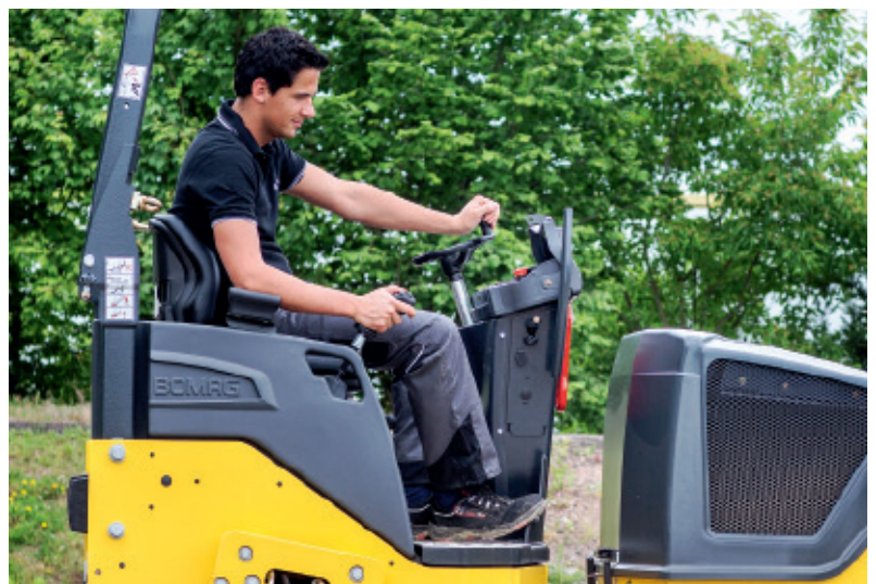
Ample leg room for the operator ensures a comfortable working environment.

The response of the control lever is very pleasant; reversing is modulated and very precise. Drum vibration can be activated selectively for the front or rear only, or for both drums. In tandem with the IVC (Intelligent Vibration Control) system, the exciter system guarantees consistent compaction and reliable operation at all times.