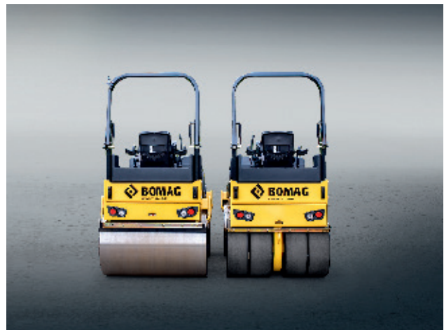
BW135/138: The heavyweights from 3.9 to 4.3 t.