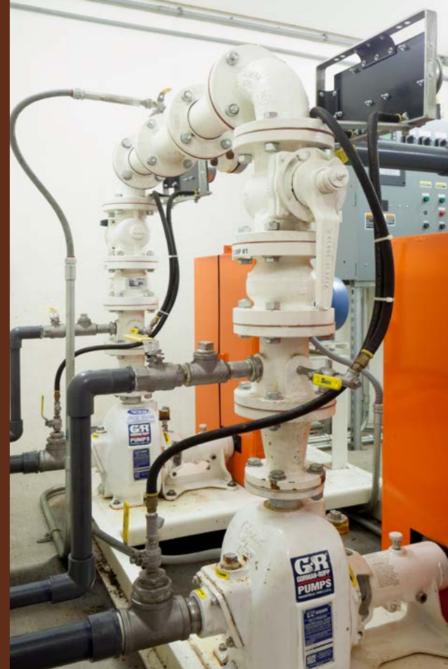
80 Series® utility water pumps

NOTE: Gorman-Rupp recognizes that the above treatment plant diagram will not apply for all municipalities and is meant for illustrative purposes only.