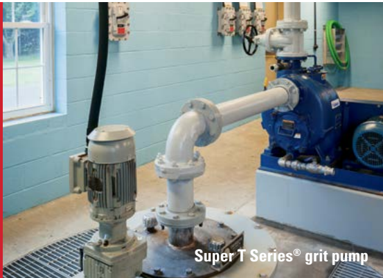
Super T Series® grit pump