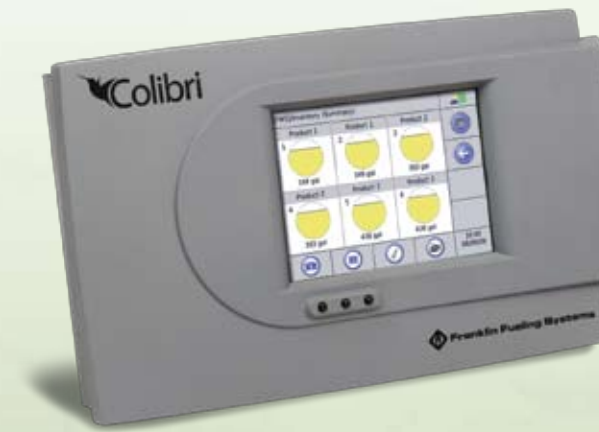
Colibri™ Automatic Tank Gauge Fuel Management Systems