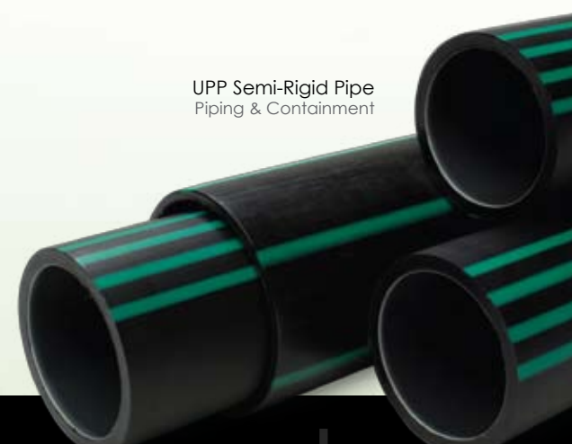
UPP Semi-Rigid Pipe Piping & Containment