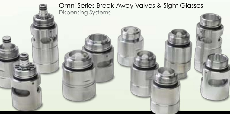
Omni Series Break Away Valves & Sight Glasses Dispensing Systems