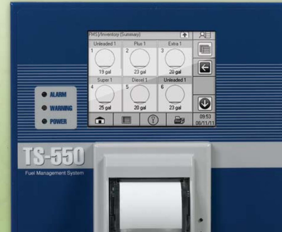
TS Series Fuel Management Systems Fuel Management Systems

Franklin Fueling Systems has a vast product offering and can deliver the most comprehensive system packages, comprised of leading-edge equipment from highly robust product lines.