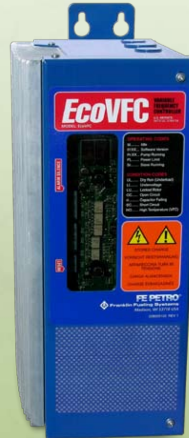
Submersible Pump Controllers Submersible Pumping Systems