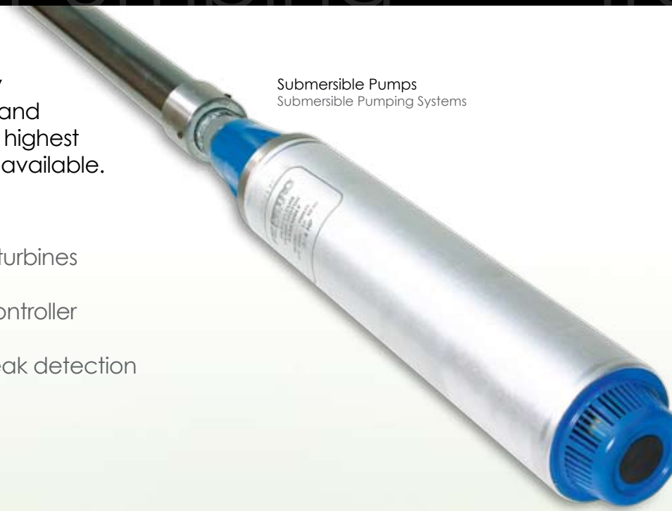
Submersible Pumps Submersible Pumping Systems