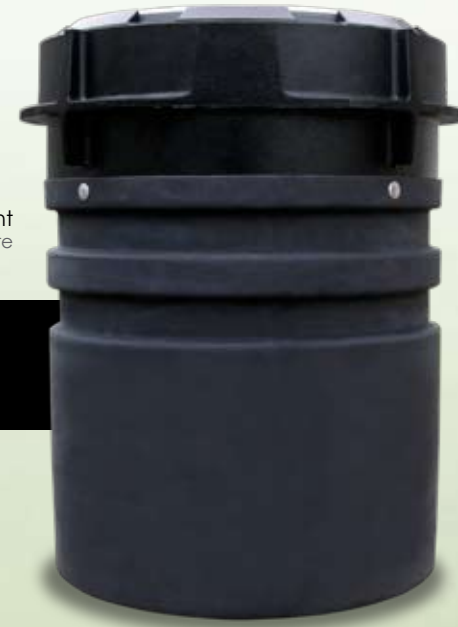
Defender Series™ Spill Containment Service Station Hardware